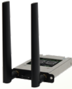
Images are for reference only. See ordering information for SKU details.

Swappable 4G LTE CAT 12 Radio Modem for Mission-Critical Communications