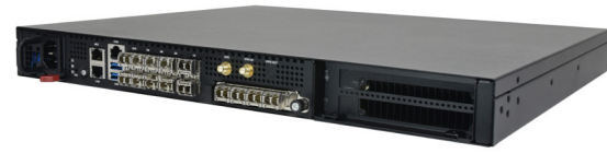
Images are for reference only. See ordering information for SKU details.