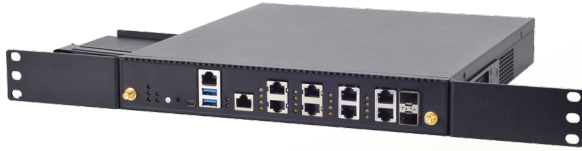
Images are for reference only. See ordering information for SKU details.

Desktop Network Appliance Powered by Intel® Xeon® D-1500 (Broadwell-DE NS) CPU