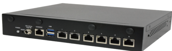
Images are for reference only. See ordering information for SKU details.

Desktop Network Appliance Powered by Intel® Atom® C3000 (Denverton/Denverton-R) CPU