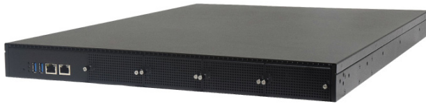
Images are for reference only. See ordering information for SKU details.

1U 19" Rackmount Network Appliance Built with Intel® Xeon® Scalable Family Processors (Codenamed Ice Lake SP)