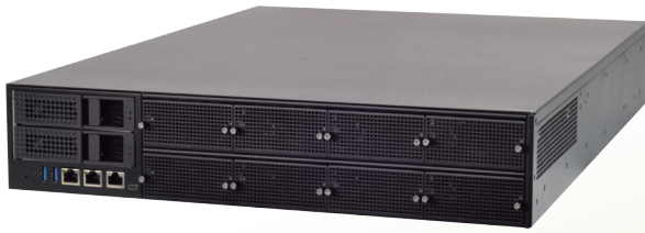
Images are for reference only. See ordering information for SKU details.