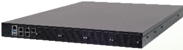
Images are for reference only. See ordering information for SKU details.

1U 19" Rackmount Network Appliance Built with 2nd Gen Intel® Xeon® Scalable Family Processors (Codenamed Cascade Lake SP)