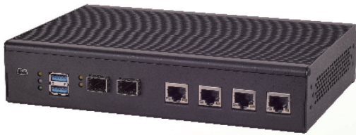
Images are for reference only. See ordering information for SKU details.

Desktop Network Appliance Powered by Intel® Atom® C3000 (Denverton) CPU