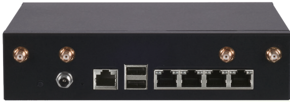
Images are for reference only. See ordering information for SKU details.

Lanner Universal Network Appliance Built with Intel® Atom® C2316 Processor (Codenamed Rangeley)